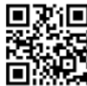
CapecodHELP.org QR Code